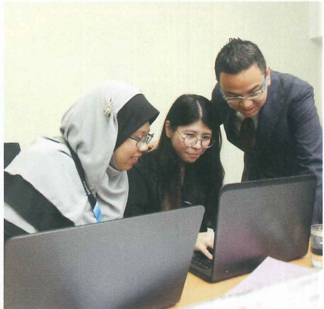
Staff from Deloitte Malaysia audited the results

To be eligible for the awards, a Centurion Club member must have been listed at least four calendar years before the end-March cut-off date in the current year as companies are evaluated on their financial performance over three years. The methodology for the awards is stringent and transparent, with the results audited by Deloitte Malaysia. Members eligible for the Highest Return on Equity Over Three Years and Highest Growth in Profit After Tax Over Three Years Awards must be profitable every year throughout the evaluation period. For this year, the evaluation period is from FY2015 to FY2018. The calculation of profit after tax growth is also subject to a risk-weight factor component to recognise the importance of consistency in profit delivery throughout the evaluation period. Winners of the Highest Returns to Shareholders award are based on total returns,