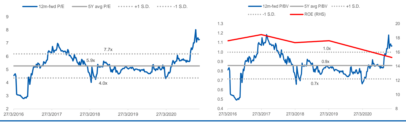
Figure 5: RCE's 12-month forward P/BV