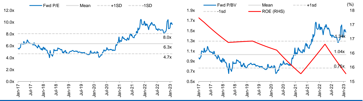
Figure 5: RCE's 12-month forward P/BV vs ROE